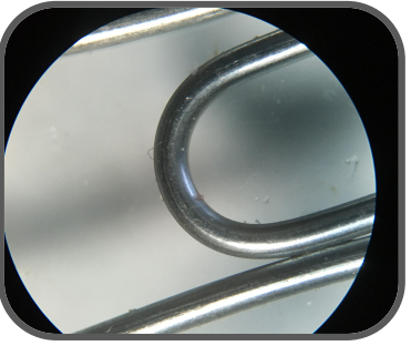
Decode the answer using 1=a, 2=b, 3=c, 4=d 4;18;25 5;18;1;19;5 13;1;18; 11;5;18 16;1;16;5;18;3;12;9;16; 13;15;15;14 13;1;16

Can you identify the mystery items under the microscope?